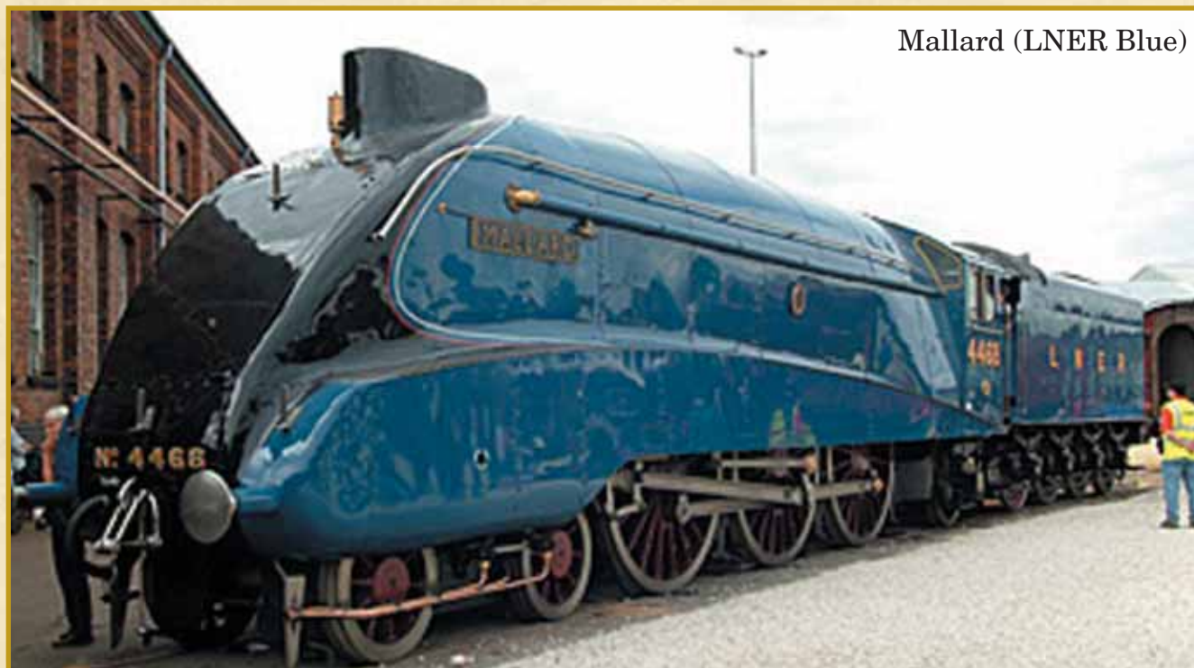
Mallard (LNER Blue)