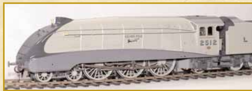
Silver Fox (2 Rail Only)