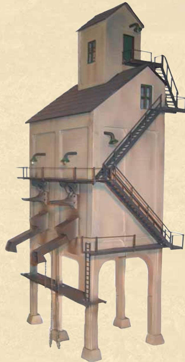
CONCRETE COALING TOWER

GGD is dedicated to bringing you scale realism at toy prices. Our coaches and sleepers are a testament to this. In 2009 we are working on the REA 54' Steel Reefer, the Observation and Dining cars for all roads that coaches and sleepers were produced. Occasionally, we produce a limited release in new roads and custom runs for dealers such as Just Trains of Delaware, Petersen Supply, JD Trains and Public Delivery Track. Look for our new concrete 100 Ton coaling tower to be released in 2009. See our web site for updates on new and exciting projects to come. Thank you for your support.