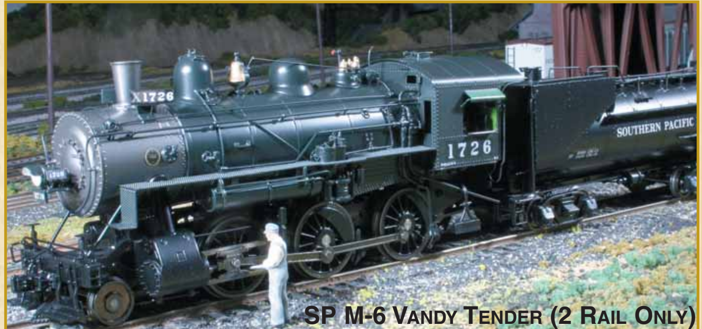
SP M-6 VANDY TENDER (2 RAIL ONLY)

Complete with directional lighting, sprung drivers, working Stephenson valve gear and fully detailed backhead. These all brass models are a bargain. 6 Cab Numbers in limited quantities.