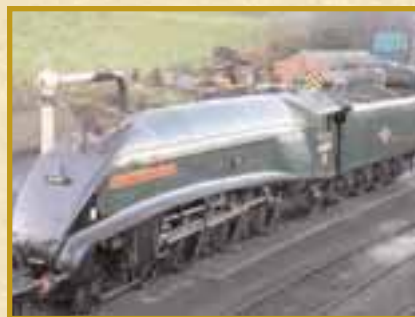
Dwight D. Eisenhower BR GREEN