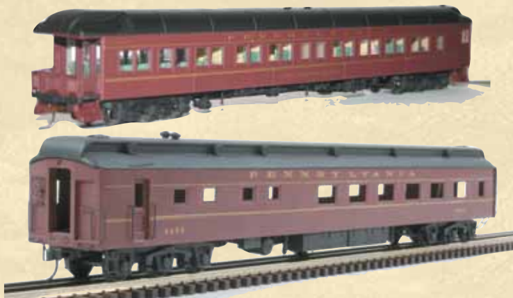
OBSERVATION DINER SET

GGD is dedicated to bringing you scale realism at toy prices. Our coaches and sleepers are a testament to this. In 2009 we are working on the REA 54' Steel Reefer, the Observation and Dining cars for all roads that coaches and sleepers were produced. Occasionally, we produce a limited release in new roads and custom runs for dealers such as Just Trains of Delaware, Petersen Supply, JD Trains and Public Delivery Track. Look for our new concrete 100 Ton coaling tower to be released in 2009. See our web site for updates on new and exciting projects to come. Thank you for your support.