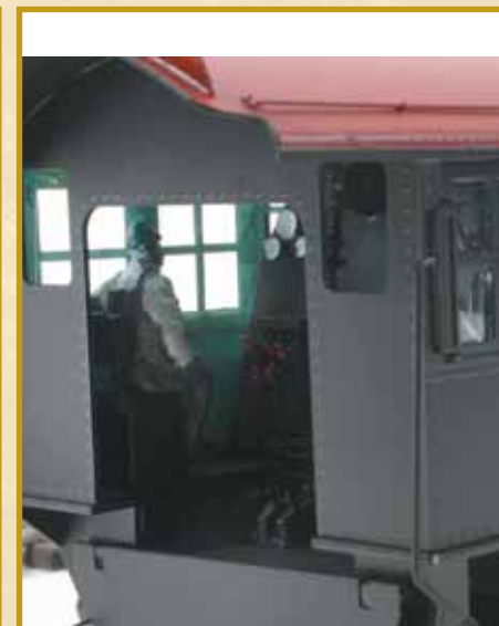
DM&IR BL-1 2-10-4 (GREY BOILER)