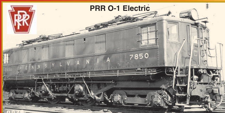
PRR O-1 Electric