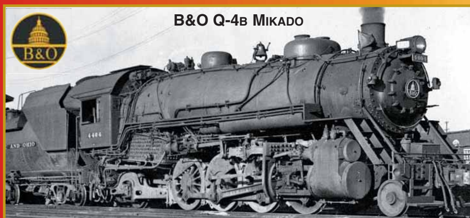
B&O Q-4B MIKADO