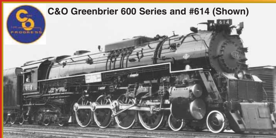
C&O Greenbrier 600 Series and #614 (Shown)