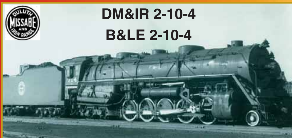
DM&IR 2-10-4 B&LE 2-10-4