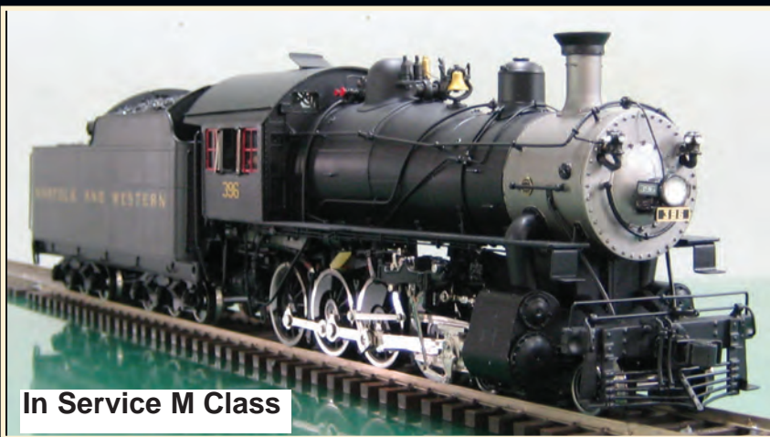
In Service M Class