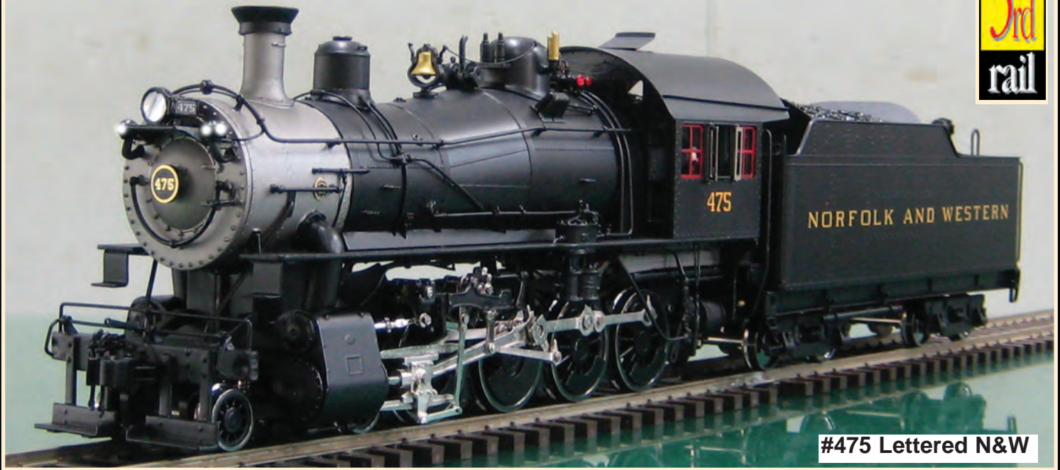
#475 Lettered N&W