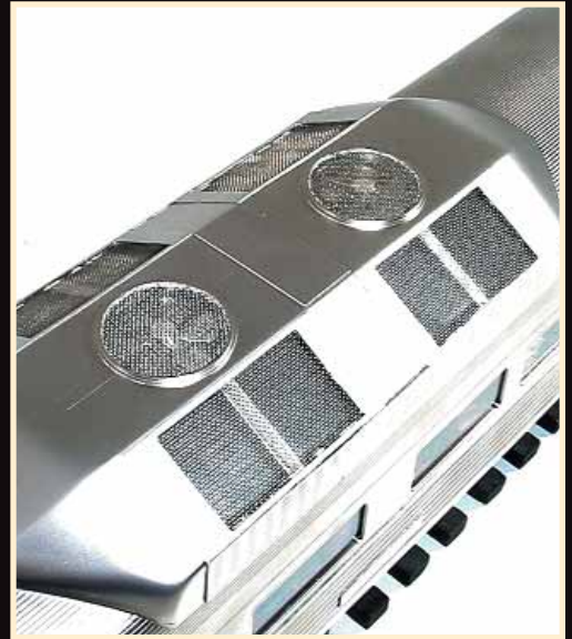
Production Sample Shown