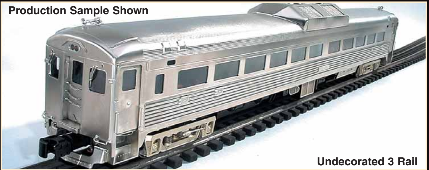
Undecorated 3 Rail

The Rail Diesel Car (RDC) was built by the Budd Company during the 1950's. RDCs were propelled by a diesel engine under the car body. The RDCs were much more economical than Diesels for these interurban route and can be still be found in operation on tourist lines.