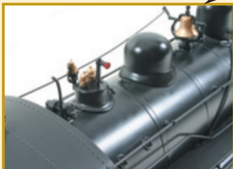
SP M9 w / VANDY