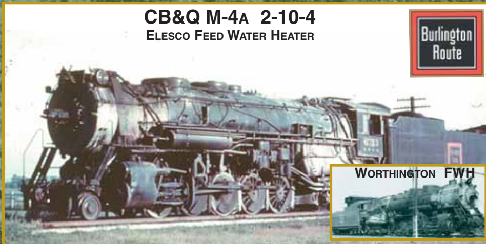
CB&Q M-4a 2-10-4 ELESKO FEED WATER HEATER