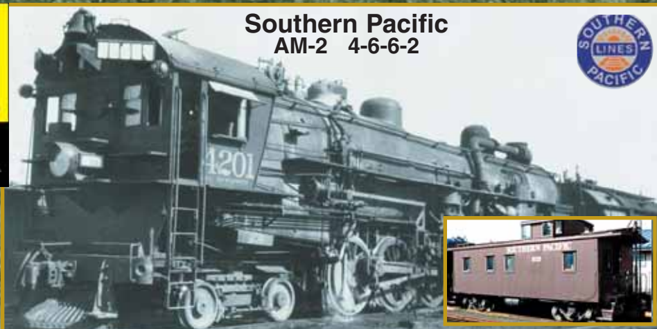
Southern Pacific AM-2 4-6-6-2