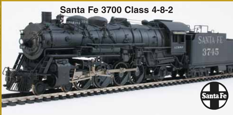
Santa Fe 3700 Class 4-8-2