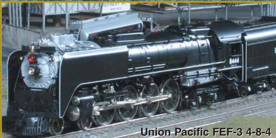
Union Pacific FEF-3 4-8-4